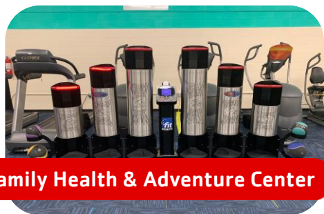
Family Health & Adventure Center