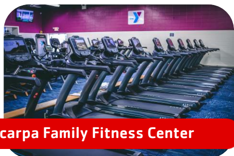
Scarpa Family Fitness Center