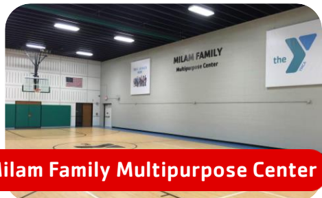
Milam Family Multipurpose Center